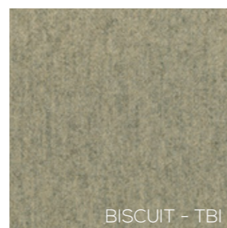
BISCUIT - TBI