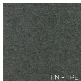
TIN - TPE