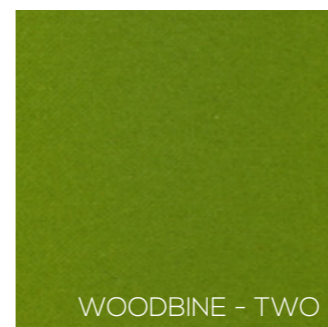
WOODBINE - TWO