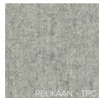
PELIKAAN - TPC