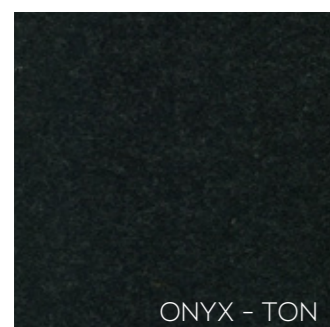
ONYX - TON

Stof Wool - 70% Wol, 20% Polyester, 5% Polyamide en 5% andere stoffen - 100.000 toeren Martindale