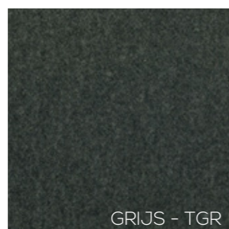
GRIJS - TGR