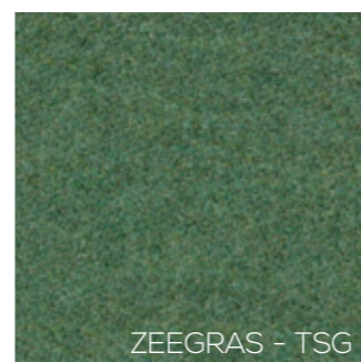
ZEEGRAS - TSG