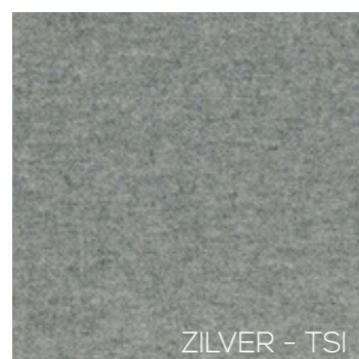
ZILVER - TSI