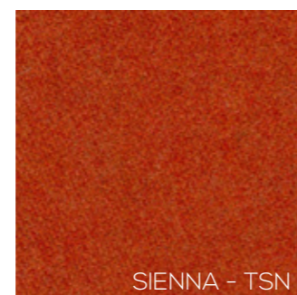
SIENNA - TSN