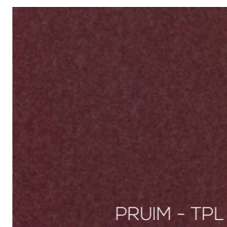
PRUIM - TPL