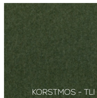
KORSTMOS - TLI