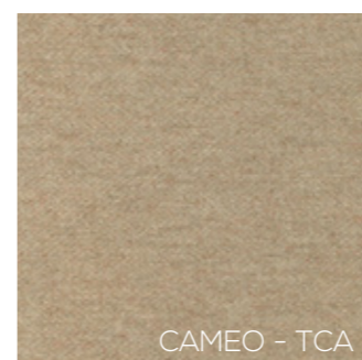
CAMEO - TCA