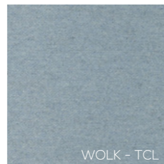
WOLK - TCL