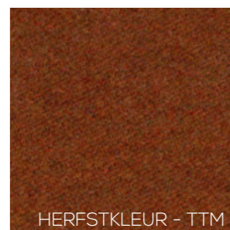
HERFSTKLEUR - TTM