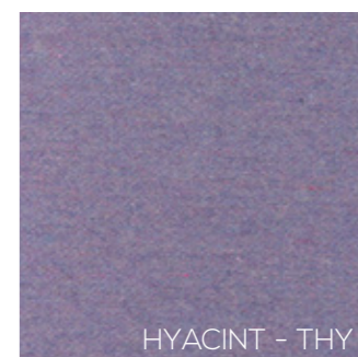
HYACINT - THY