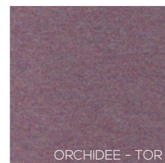
ORCHIDEE - TOR