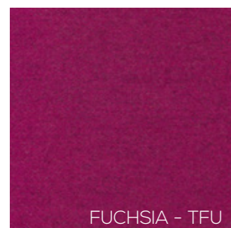
FUCHSIA - TFU