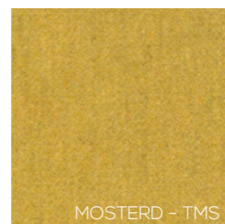
MOSTERD - TMS