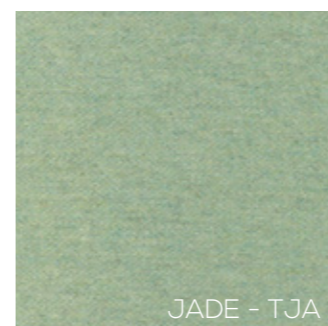
JADE - TJA