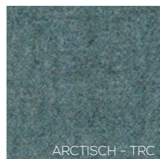
ARCTISCH - TRC