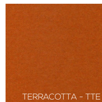
TERRACOTTA - TTE