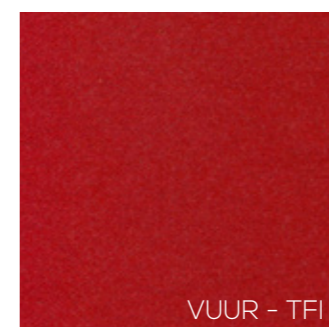
VUUR - TFI