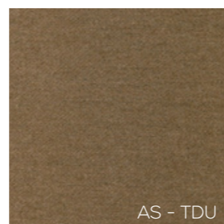
AS - TDU