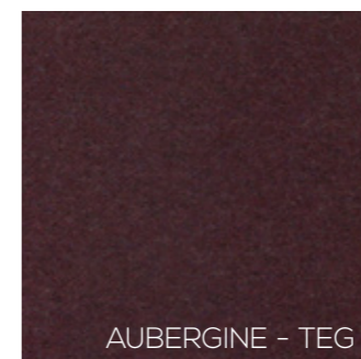
AUBERGINE - TEG