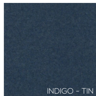
INDIGO - TIN