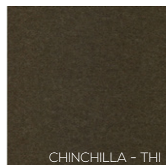
CHINCHILLA - THI