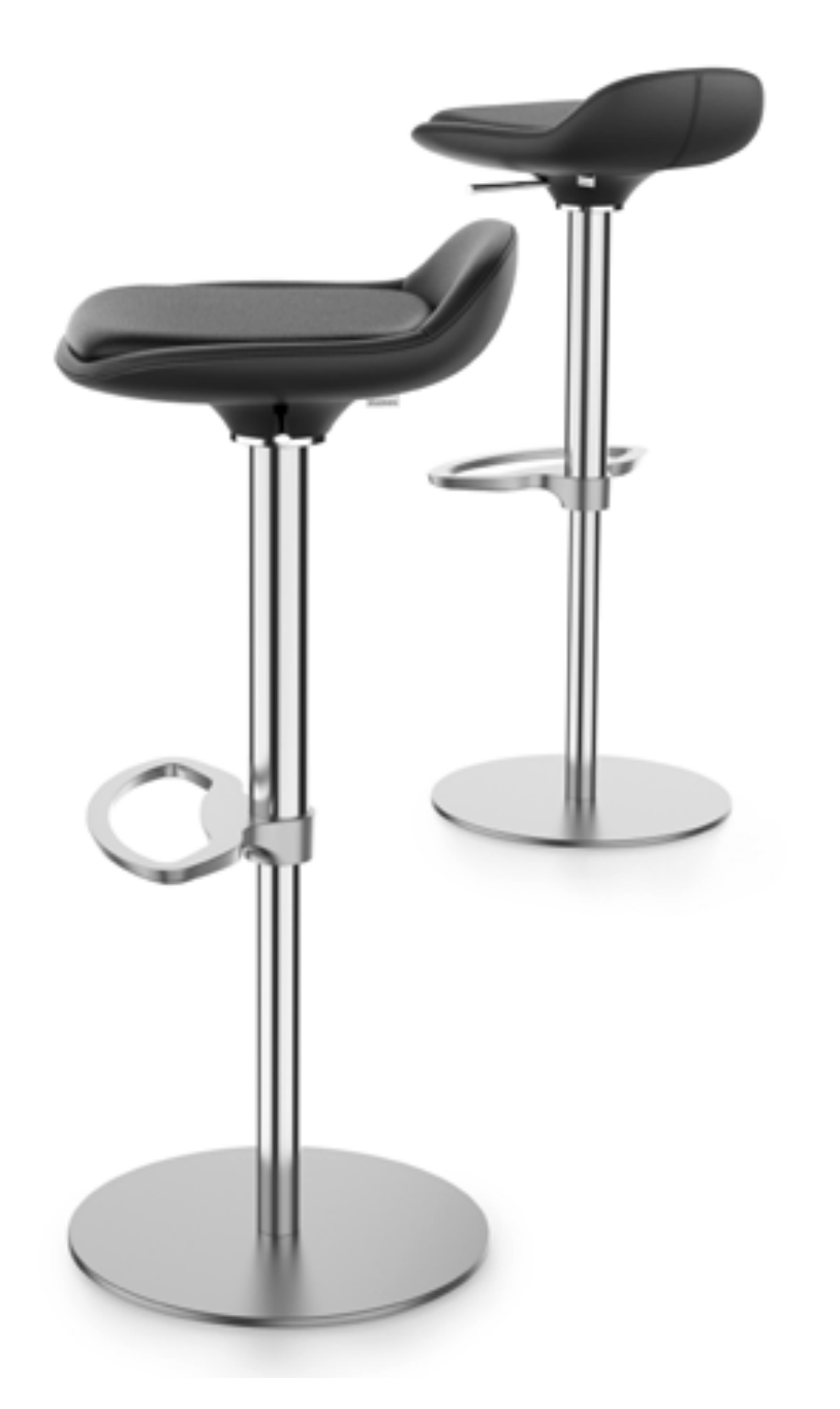
barkruk, met voetensteun

Flexible, attractive and always at the right height: The height-adjustable LIMEIS5 barstool combines a modern design with smart technical features: The characteristic footrest brings out the fluid shape of the barstool, while the subtly integrated handle in the seat allows for comfortable, easy transportation