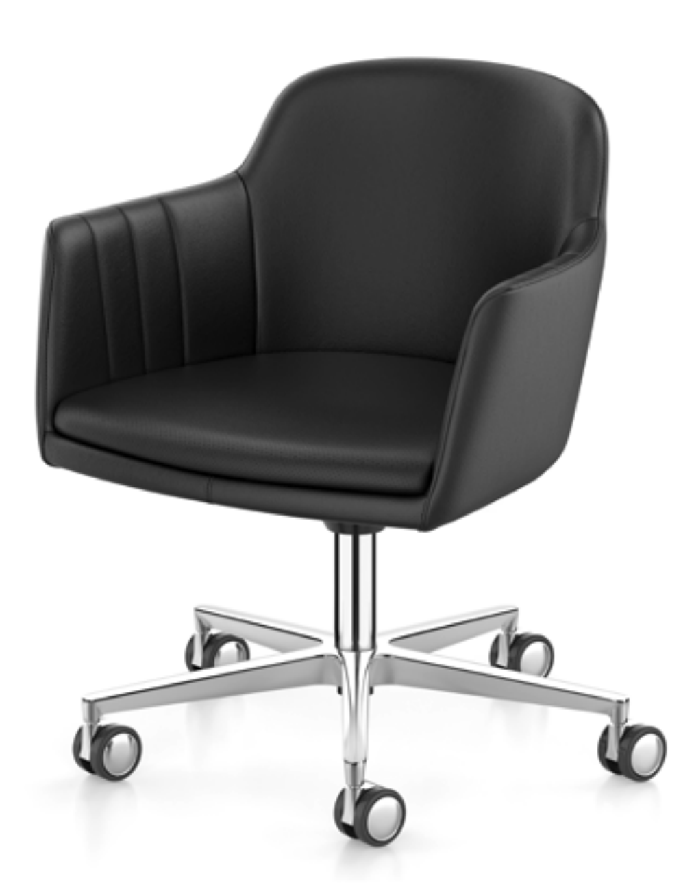
clubfauteuil, vijfteens voetkruis, kanteltechniek, vergrendelbaar