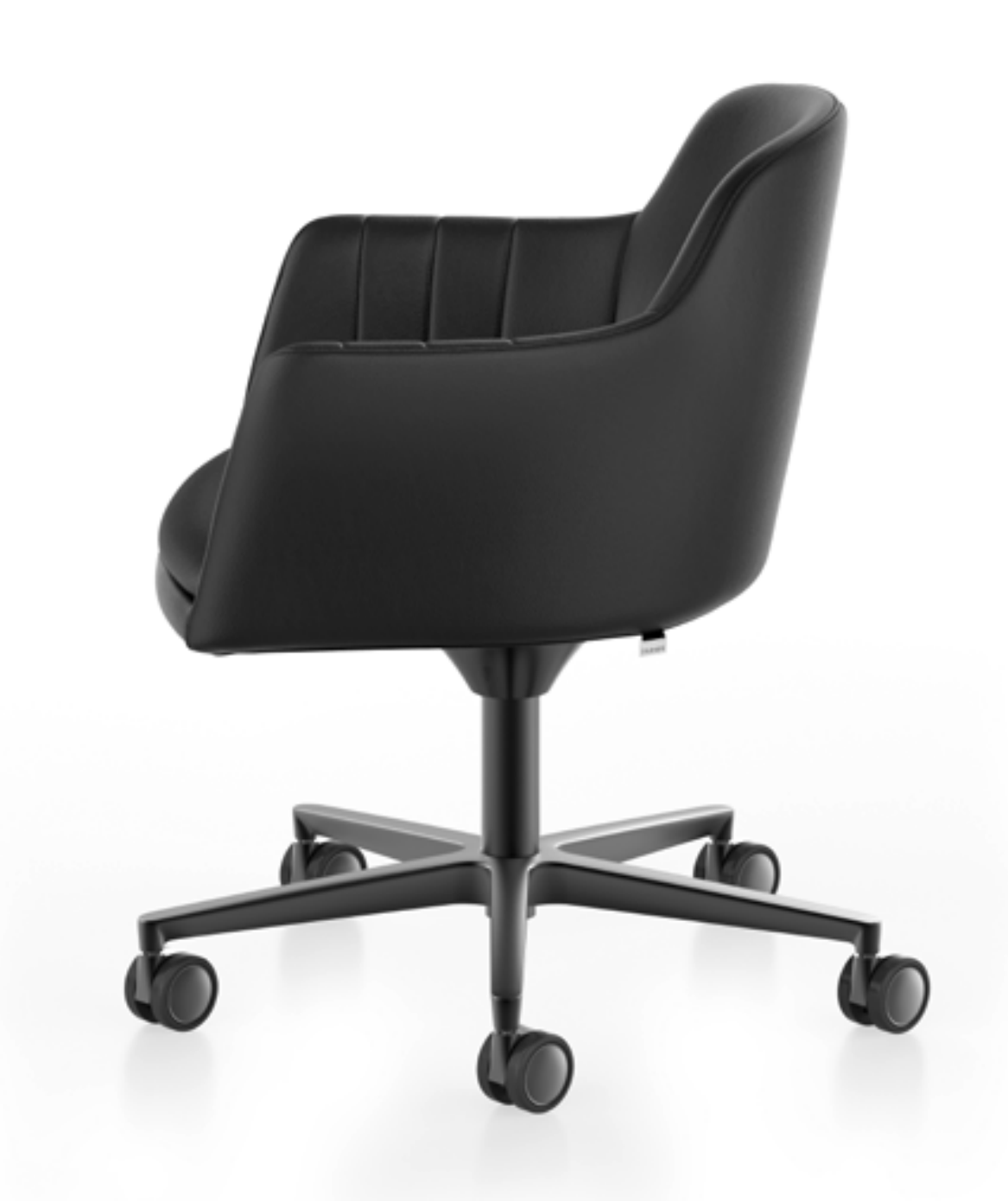
clubfauteuil, vijfteens voetkruis