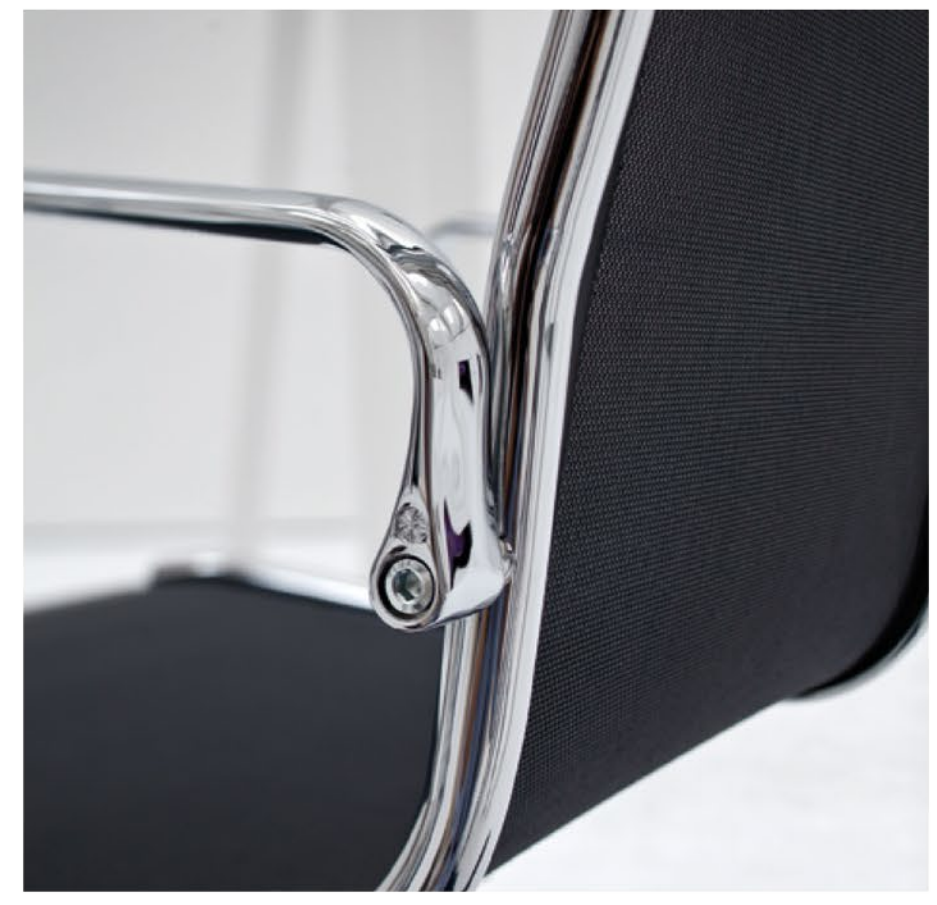
Detail of the armrest and of the fixing device.