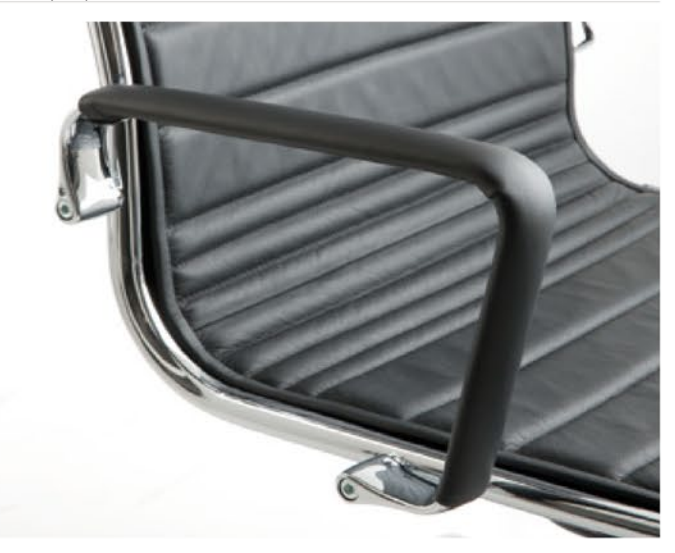
Armrest in the fully upholstered version.