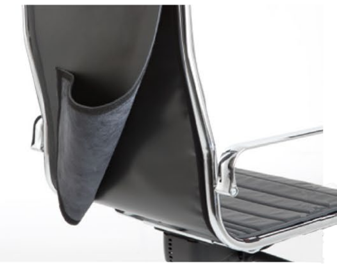
How the Light upholstery could easily be removed.