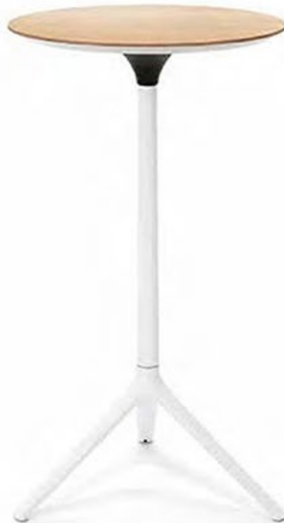
719K (718K - 720K)