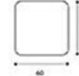
716K Standing table 60 x 60 cm