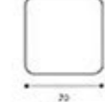
717K Standing table 70 x 70 cm